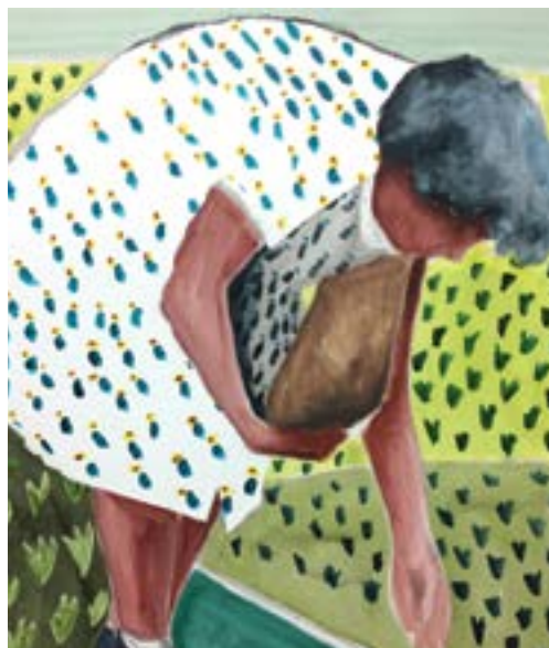
Kurt Lightner, Builders/Growers Series Worker #19 , acrylic/collage on canvas, 52" X 40"