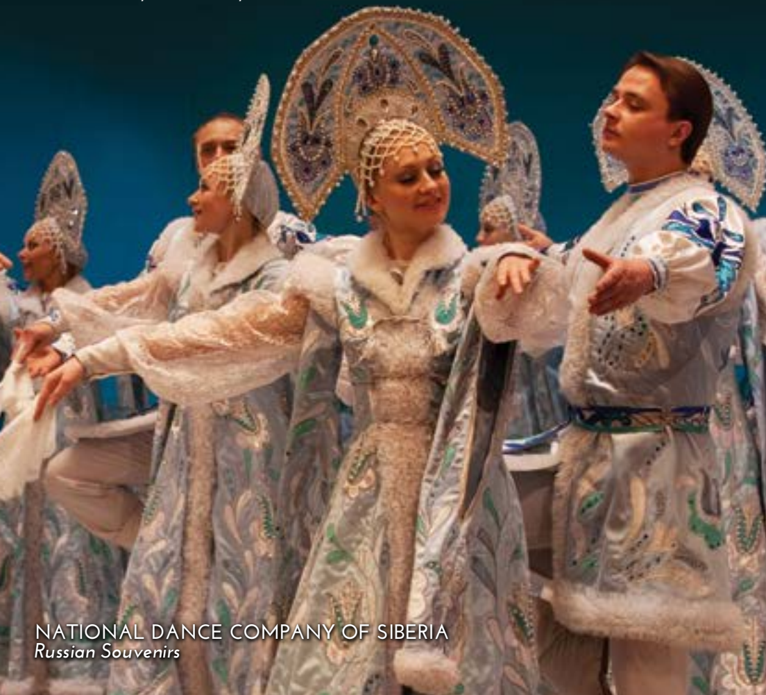
NATIONAL DANCE COMPANY OF SIBERIA Russian Souvenirs

Smart Arts is just that: first-rate, affordable, and conveniently located with ample free parking and ticket discounts for children, students, and seniors.