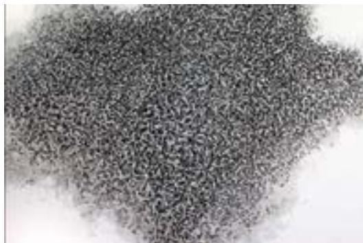
Edward Burke, Plastic Sea , acrylic/canvas, 60" X 48"

Artist's website: https://www.edwardaburke.net