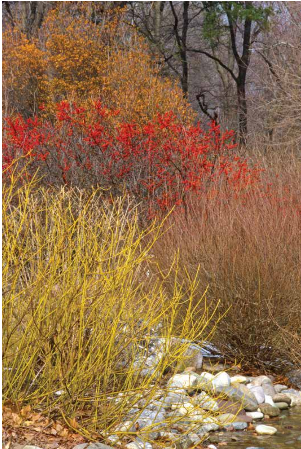
Winterberry holly and northern bayberry combine with yellow twig dogwood, Virginia sweetspire, and shrub willows to provide winter habitat for wildlife in this streamside garden at Green Spring Gardens in Alexandria, Virginia.

Ideally, try to catch plants in bloom. Even then, it's hard to tell the sex of tiny spicebush, willow, and holly flowers with the naked eye. Male and female flowers look about the same except for anthers or pistils, visible through an inexpensive 30-90x magnifying jeweler's loupe. Male spicebush flowers seem bigger and fluffier than