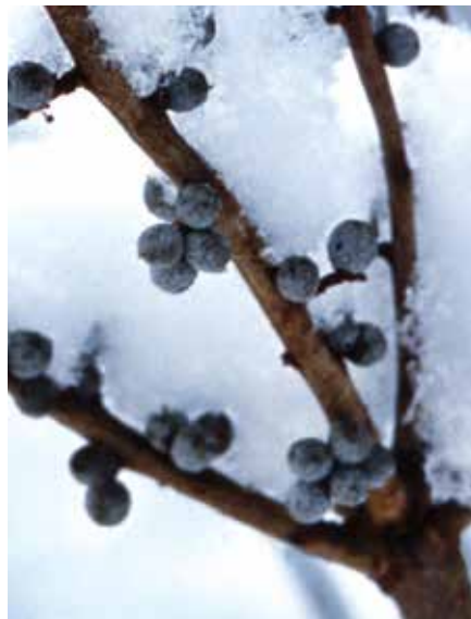
Bayberry fruits are favored by chickadees, catbirds, and many other bird species.