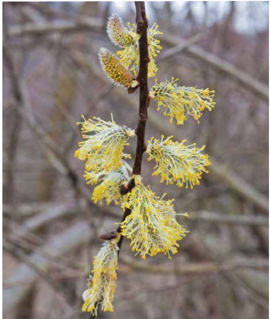
Opening in early spring, pollen-laden male pussywillow flowers provide sustenance to native bees and other insects during a critical period when little else is available.