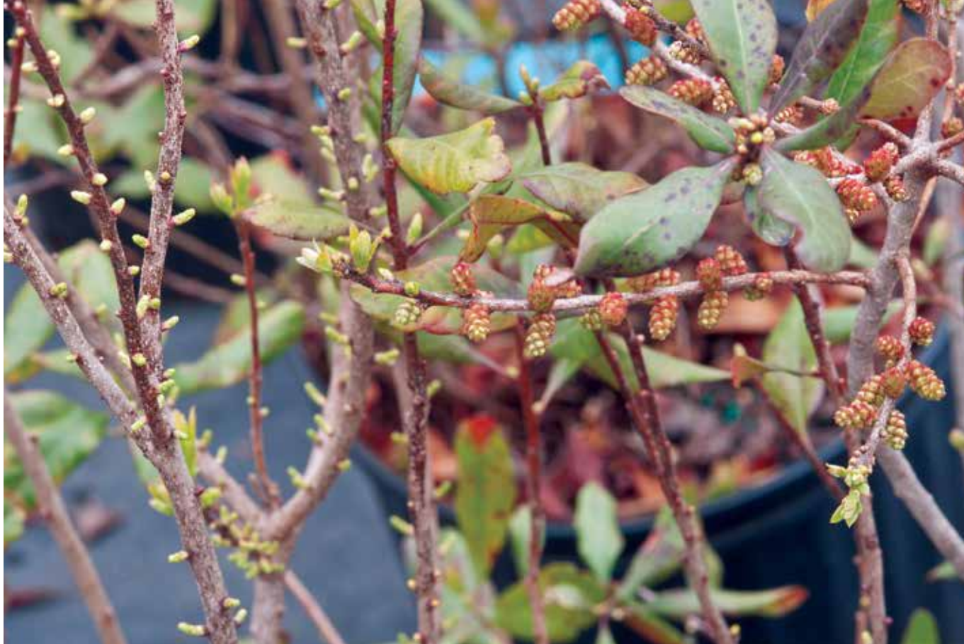
Bayberry female flowers (left) are small and appear singly along stems, while larger conelike male flowers (right) are borne in dense clusters.

tilized female willows develop flask-shaped carpals (seed capsules) filled with hundreds of tiny seeds, attached to hairs that allow them to become airborne. Look for bright yellow or orange coloration on otherwise drab willow catkins. That's the pollen, and, as with all dioecious plants, the clear giveaway that it's a male.