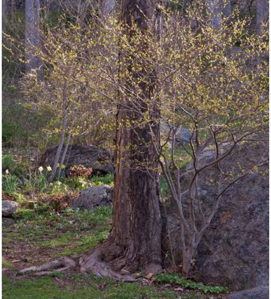
A male spicebush blooms in the author’s Connecticut garden in early spring.

A veil of light yellow shimmering through woods and wetlands in early spring announces the presence of northern spicebush ( L. benzoin ) in bloom. While the southern spicebush species ( L. melissifolia and L. subcoriacea ) are rare and endangered, northern spicebush is common from Maine to Florida and as far west as Texas. Small clusters of tiny flowers bloom on bare branches of this medium-sized single or multi-stemmed shrub. Though it blends into the greens of summer, its foliage is critical for spicebush swallowtail butterfly larvae that depend on it for food. In fall, plump, lipid-filled, red berries ripen among butter-yellow foliage, just in time to fuel birds’ migration south. Leggier and less fruitful in deep shade, spicebush is sometimes the only understory shrub that survives deer devastation.