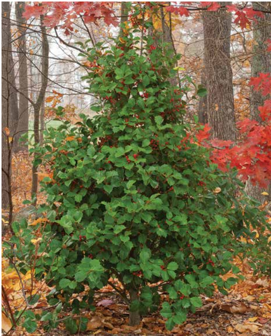
'Satyr Hill' is a female selection of American holly with a dense pyramidal habit seen here at Highstead, an arboretum and research forest in Redding, Connecticut.

Woodlanders Nursery , Aiken, SC. www.woodlanders.net .