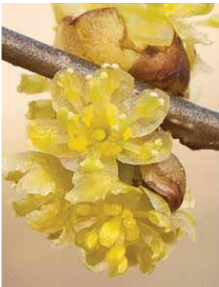
Pollen-laden anthers in this flower confirm that this spicebush is male.

Delaware-based entomologist and author Douglas Tallamy ranks native willows second only to oaks as the best host plant for moths and butterflies. Most of the 97 North American willows are small-to-medium shrubs or small trees with fine-textured foliage and low-maintenance requirements. Widely distributed across the continent, black willows ( S. nigra ) grow the largest. Most willows form thickets along wet edges, making them excellent for rain gardens, but there are also upland species like Scouler's willow, also known as western pussy willow ( S. scouleriana ). Western prairie/riparian species include the golden willow ( S. lutea ) and peachleaf willow ( S. amygdaloides ). Northwestern alpine willow ( S. petrophila ) forms short, prostrate mats with large catkins. Seek most of these species out at restoration nurseries.