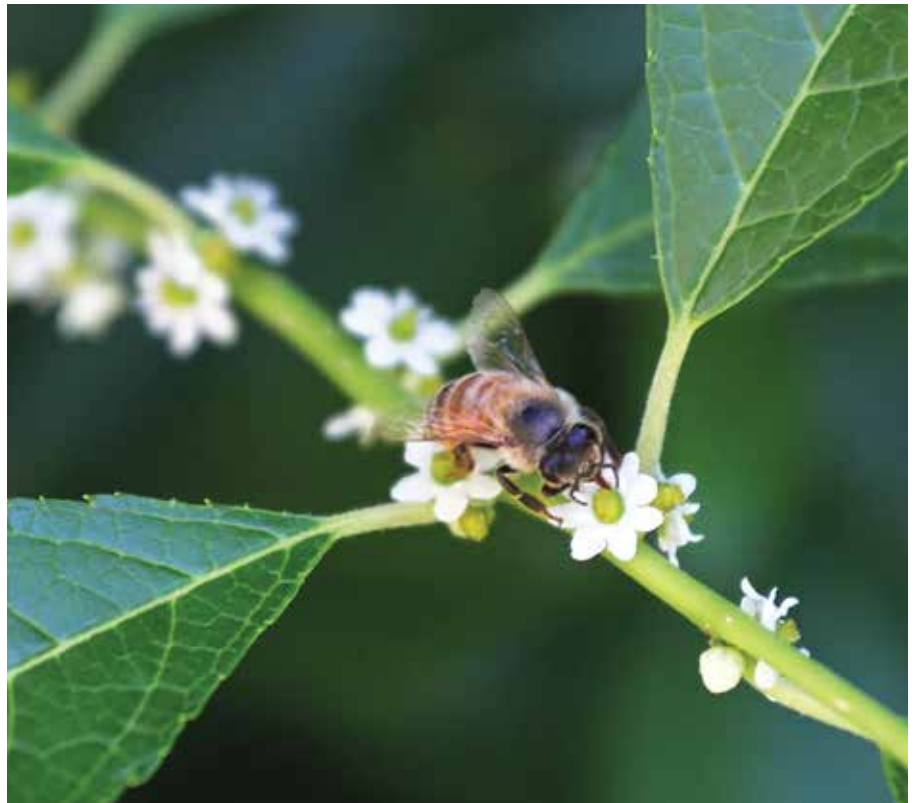
A honeybee visits a female Ilex verticillata flower for its nectar.

Why is this important, you may ask? Well, the simple answer is that if you are planting dioecious shrubs, you need to make sure you have both male and female specimens to guarantee a chance for successful pollination. Otherwise, it's unlikely these plants will develop the seeds or berries that add winter interest to the garden and provide all the benefits of pollen, nectar, and fruits that sustain birds and other wildlife.