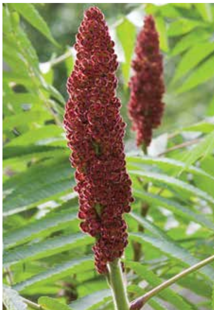
Top: Male staghorn sumacs produce small flowers in loose panicles. Above: Females are distinguished by their dense clusters of colorful, edible fruit, known as sumac bobs.