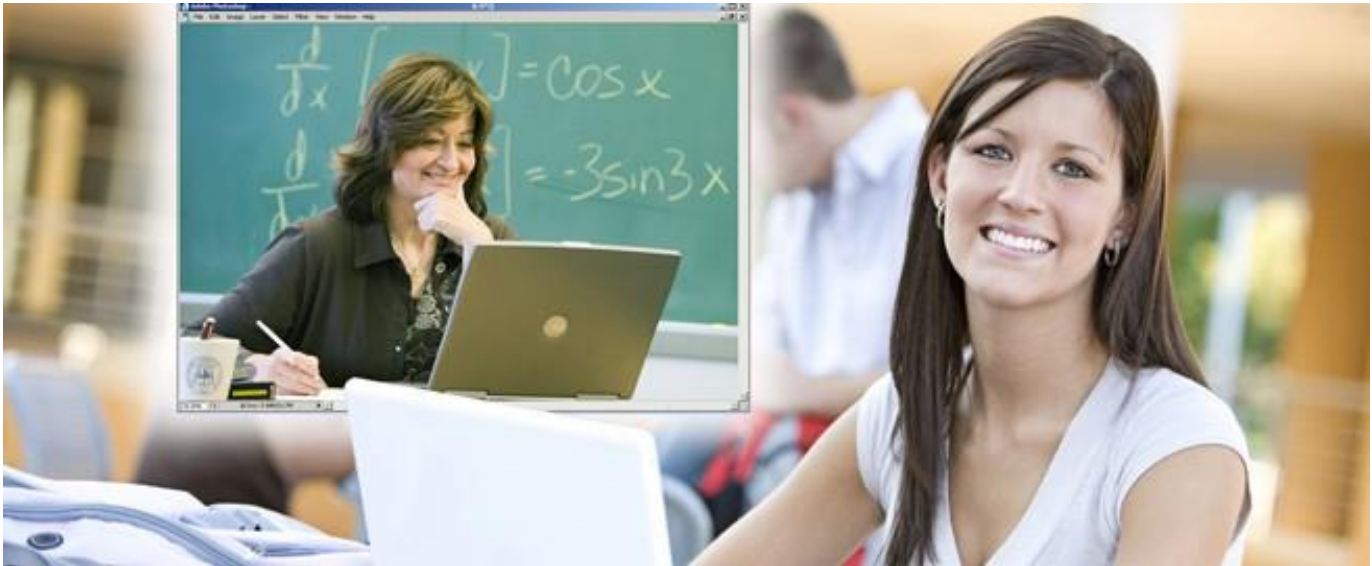
Figure 1 Teacher behind laptop at desk smiling. Student behind laptop at desk smiling