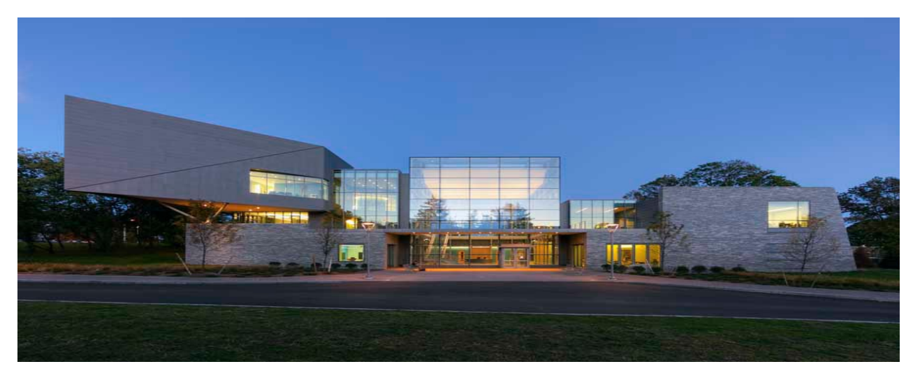
Westchester Community College