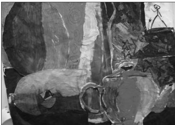
Painting and Drawing