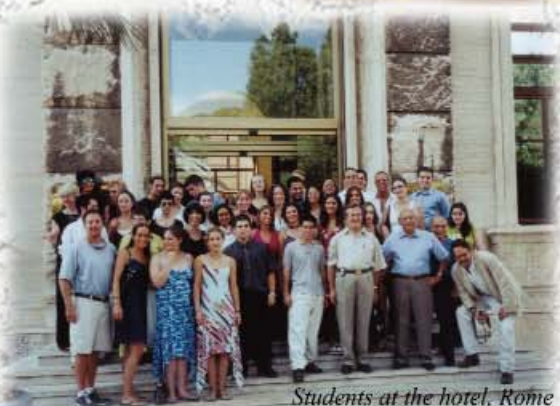
Students at the hotel, Rome