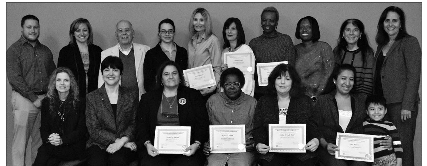
Graduates, Staff, and members of the Westchester Community College Administration

Search Skills: Resume Writing, Interviewing, Online Job Search, Group & Individual Career Counseling